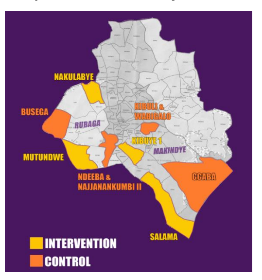
Map 1: The SASA! study site

The SASA! study was conducted in eight communities, comprising 12 parishes, in two administrative divisions of Kampala District – Makindye and Rubaga, neither of which had had any prior exposure to SASA!. These communities contained approximately 66,500 households and 251,500 inhabitants. The communities were relatively impoverished and were characterised by concentrations of people who had migrated from other parts of Kampala and Uganda in search of employment. Mobility in many parts of the study area is high, with people moving in search of employment opportunities and improved living conditions.