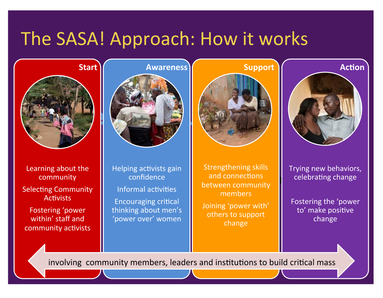
Figure 3: Four phases of SASA!

The final phase (Action) aims to consolidate and normalise a greater sharing of power and non-violence, demonstrating the benefits of more equal relationships, and as a result, preventing VAW and reducing HIV and AIDS risk. The thrust of this phase is to encourage community members, leaders, professionals and institutions to use their 'power to' take action to address gender inequality and violence. Special emphasis is placed on formalising change within community groups, local leadership structures, service delivery points and institutions.