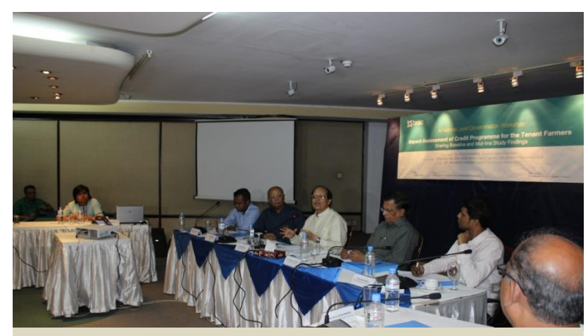
National level seminar