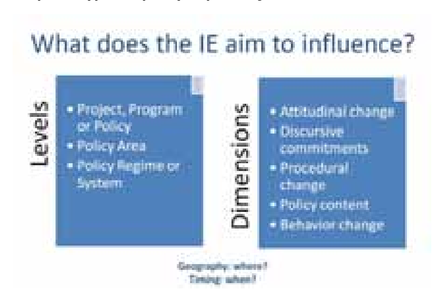
Graph 1: Types of policy impact objectives: Levels and dimensions<sup>1</sup>