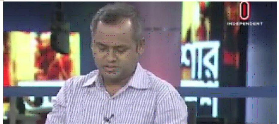
TV talk show

We definitely want to review the study after three to four years.