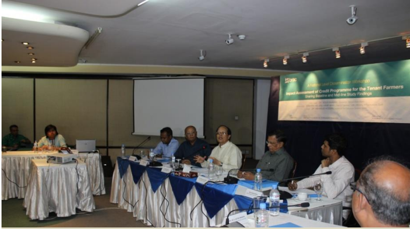
National level seminar